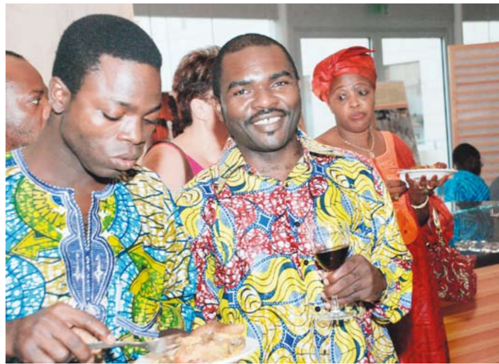
Graduates of the MASHAV program at the Africa Day celebration this week in Jerusalem.

Landau told Anglo File that he hoped that the visit by Lieberman – the head of Landau's own Yisrael Beiteinu party – would "curb Iranian domination." Regarding Iran, he said, "They've been investing effort, funds and human